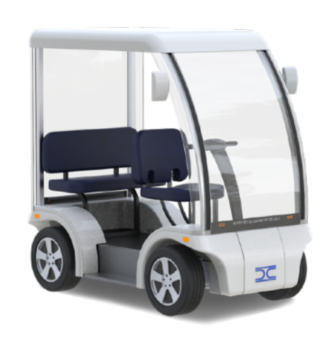
The City-KURT for personal mobility

Much attention was paid to the production cost as well as the life-cycle cost. The result is a patented structure using high-strength aluminum that is 100% recyclable providing a low empty weight. As a result the energy consumption is lower than with traditional designs, resulting in better range, performance and load capability.