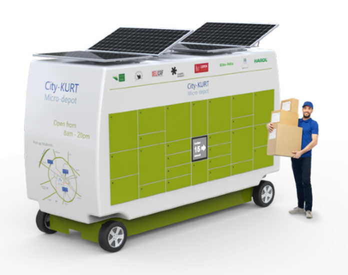
The multi-functional City-KURT Station as a micro-depot in the City-KURT City-grid

By restructuring the different modules, KURT can be adapted to be a very small vehicle or a large vehicle, regardless whether we are talking about transport of passengers or goods. The propulsion modules are standardised, which keeps production costs low. Meanwhile, the robust superstructure provides robustness and functionality. The low total weight of the aluminum vehicle enables it to carry heavy cargo and to reach a long driving range. The sensors of each vehicle can be remotely monitored while each KURT can be remotely controlled using a smartphone or tablet.