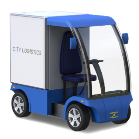
The City-KURT for City-Logistics