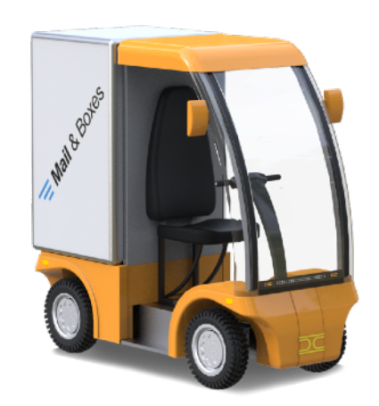
The City-KURT for transporting mail and small parcels