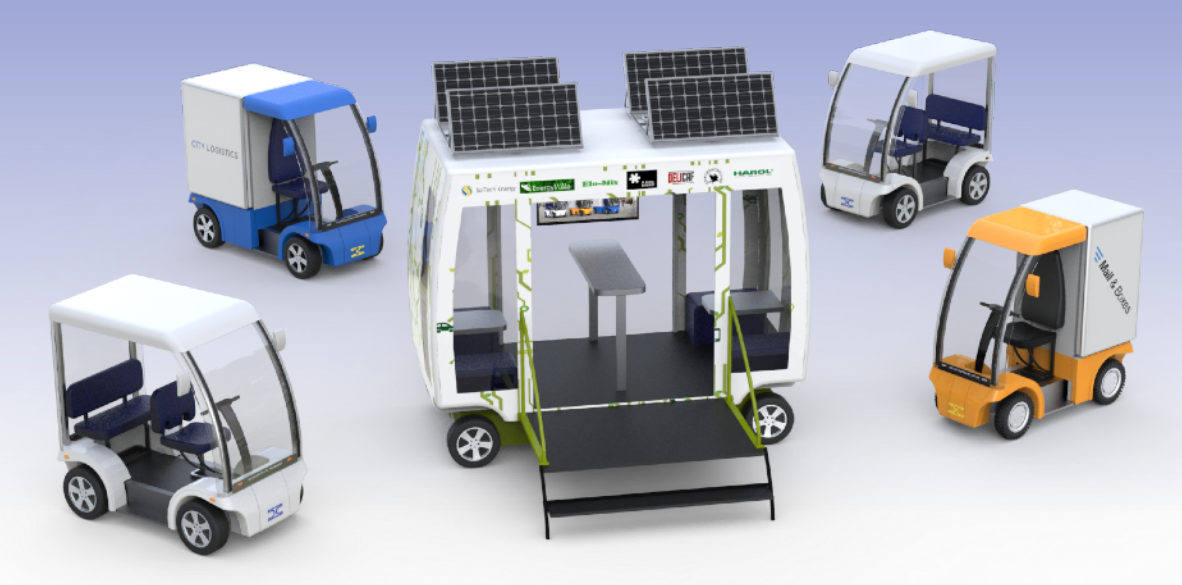
Belgian SME develops innovative and unique electric vehicle concept