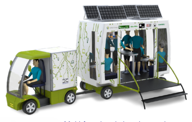
Multi-functional charging station