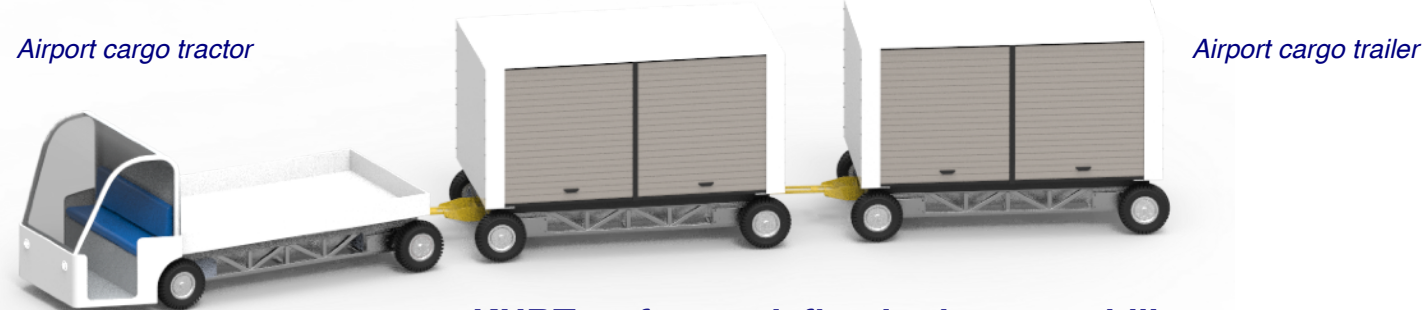
KURT: software defined urban e-mobility