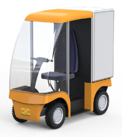
Typical City-KURT variants